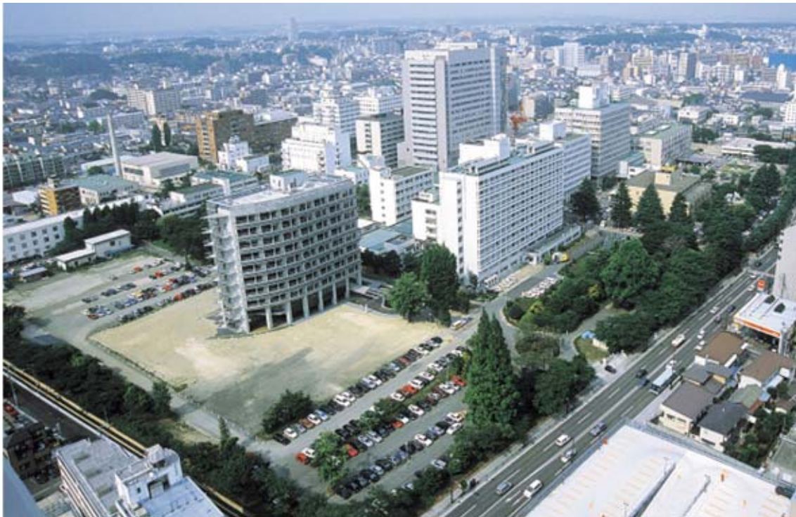
Tohoku University Graduate School of Medicine